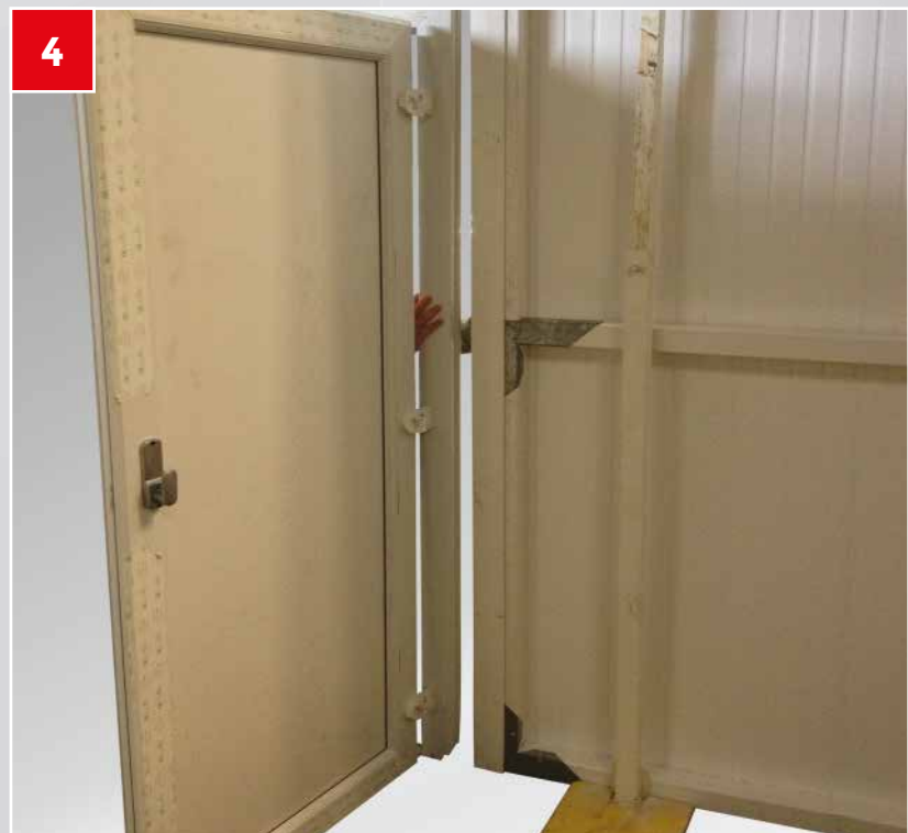
Place Door into H Section – Leave door open.

Tel: 0844 84 8 4166 Fax: 0844 848 4188 email: info@reuseawall.com website: www.reuseawall.com