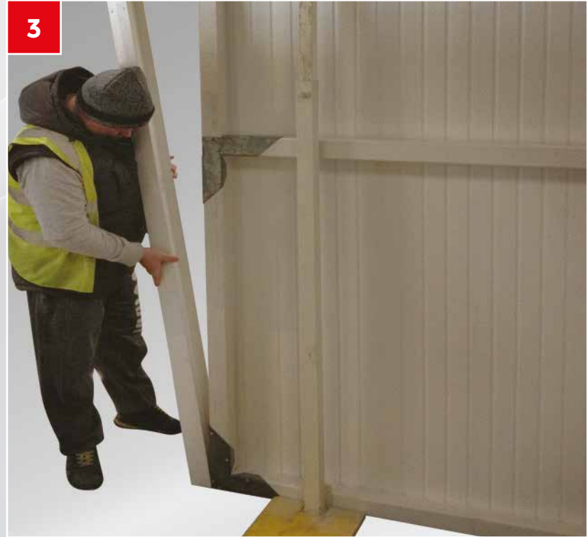
Place H Section on the Panel.