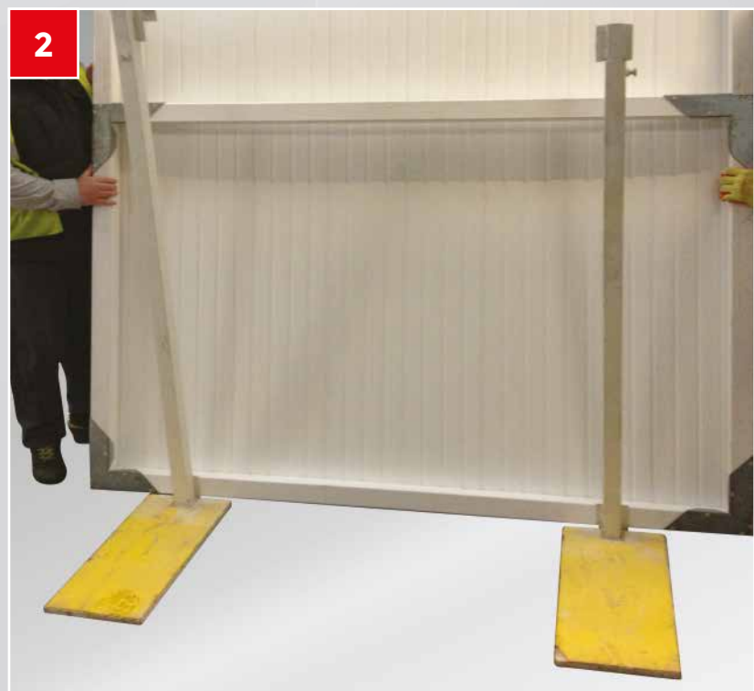
Place Panel into Upstands.

Tel: 0844 84 8 4166 Fax: 0844 848 4188 email: info@reuseawall.com website: www.reuseawall.com