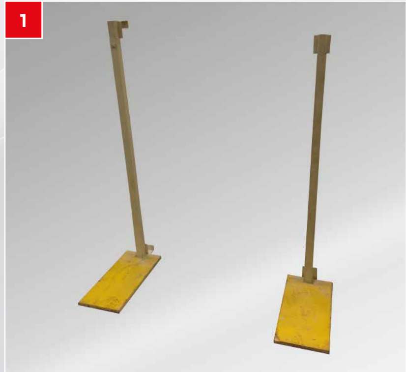
Place Upstands 250mm from the ends of the Panel.