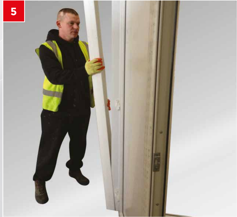
Place H Section on to Door.